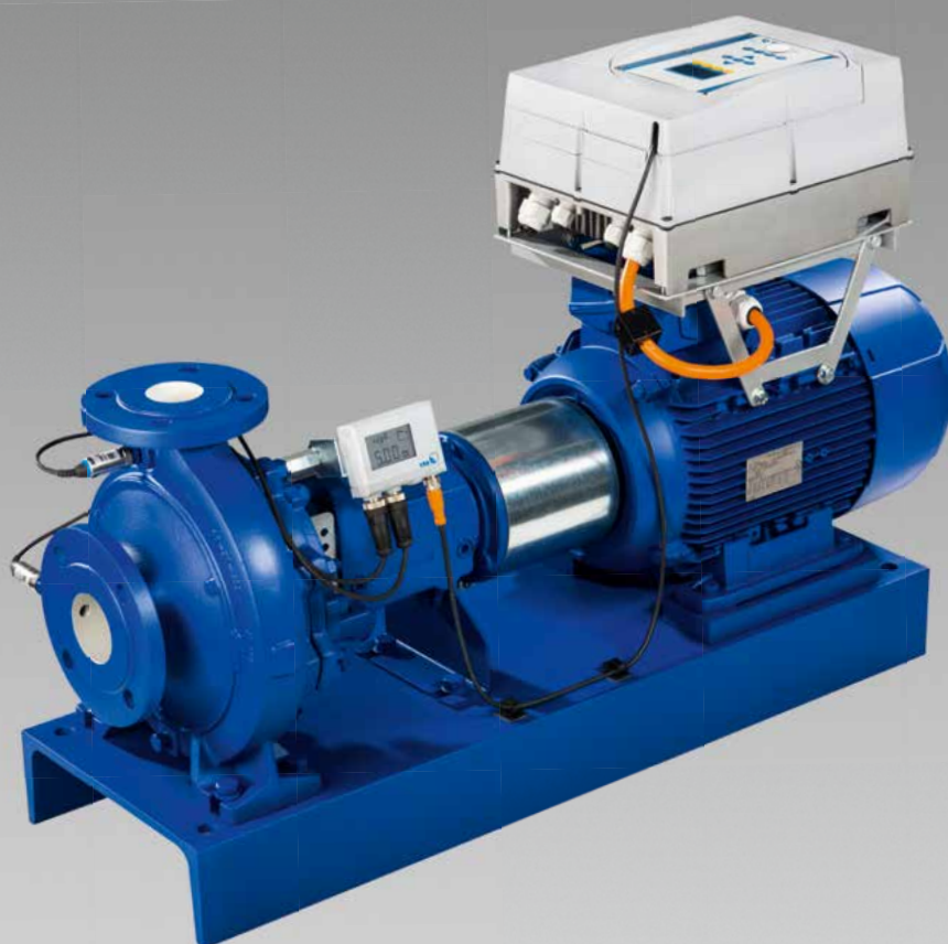
Etanorm PumpMeter; PumpDrive and IE2-motor