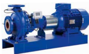
Etanorm PumpMeter and IE2-motor