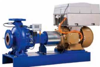
Etanorm with SuPremE motor, PumpMeter and PumpDrive